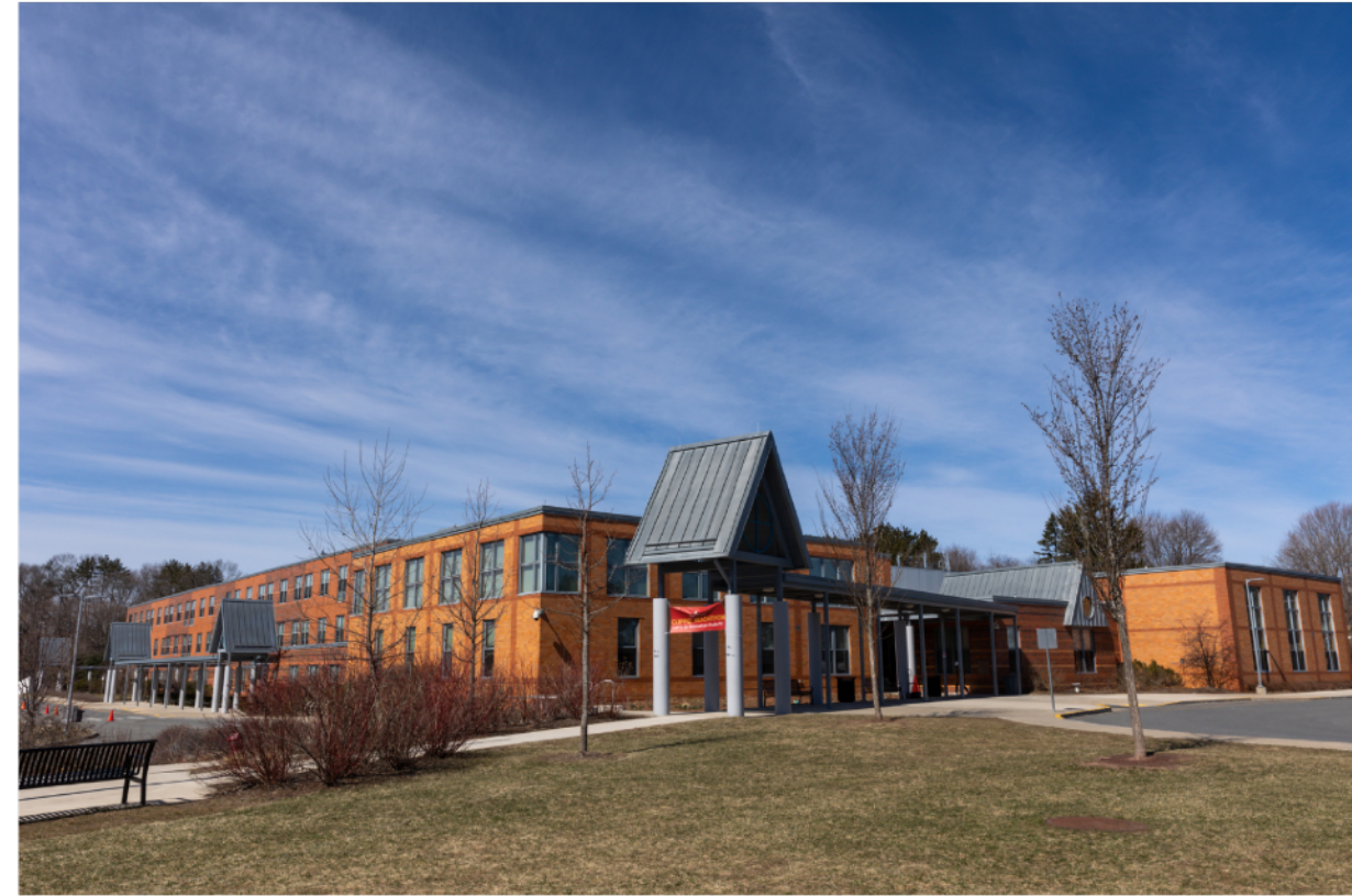
Francis T. Bresnahan Elementary