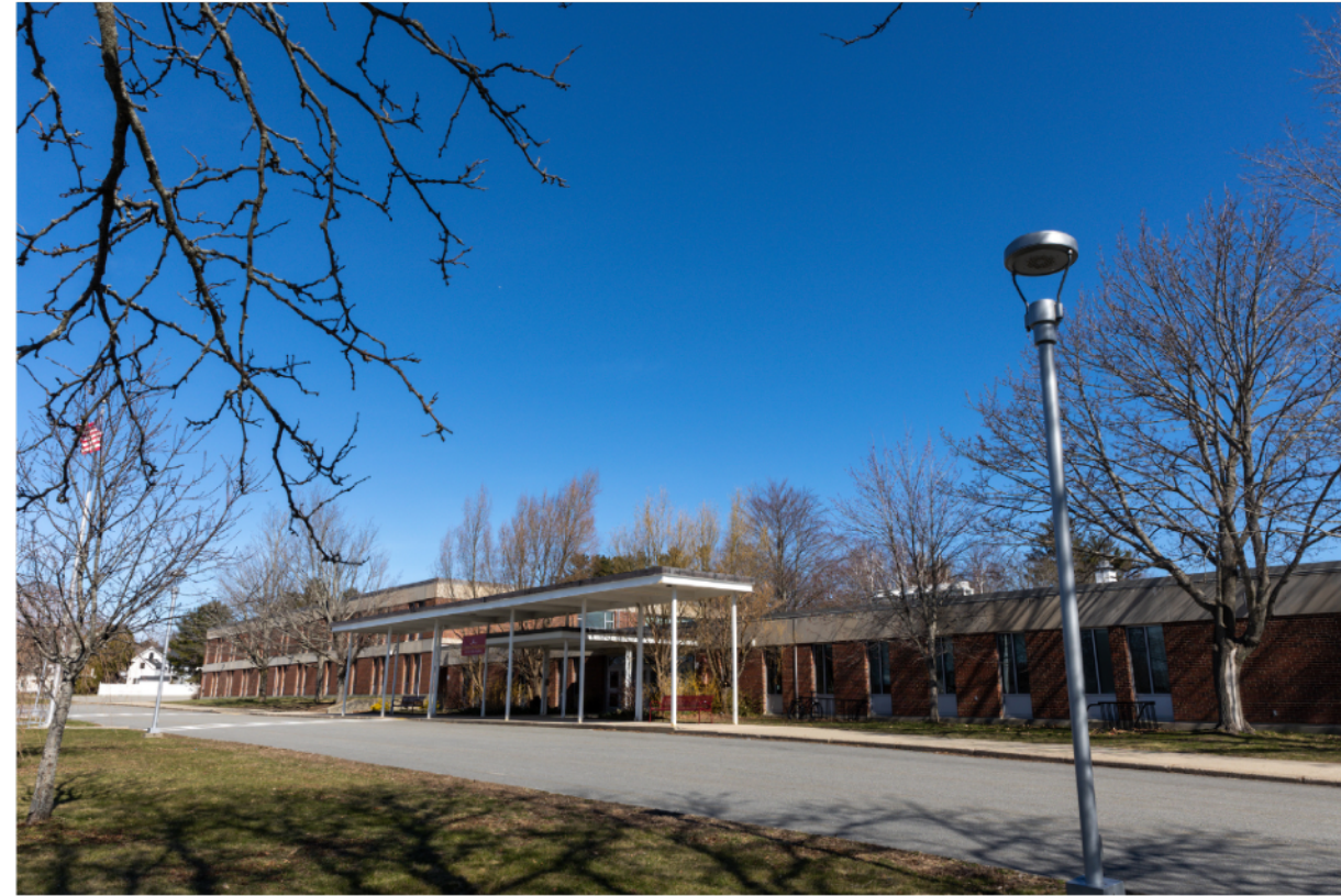
Edward G. Molin Upper Elementary Rupert A. Nock Middle