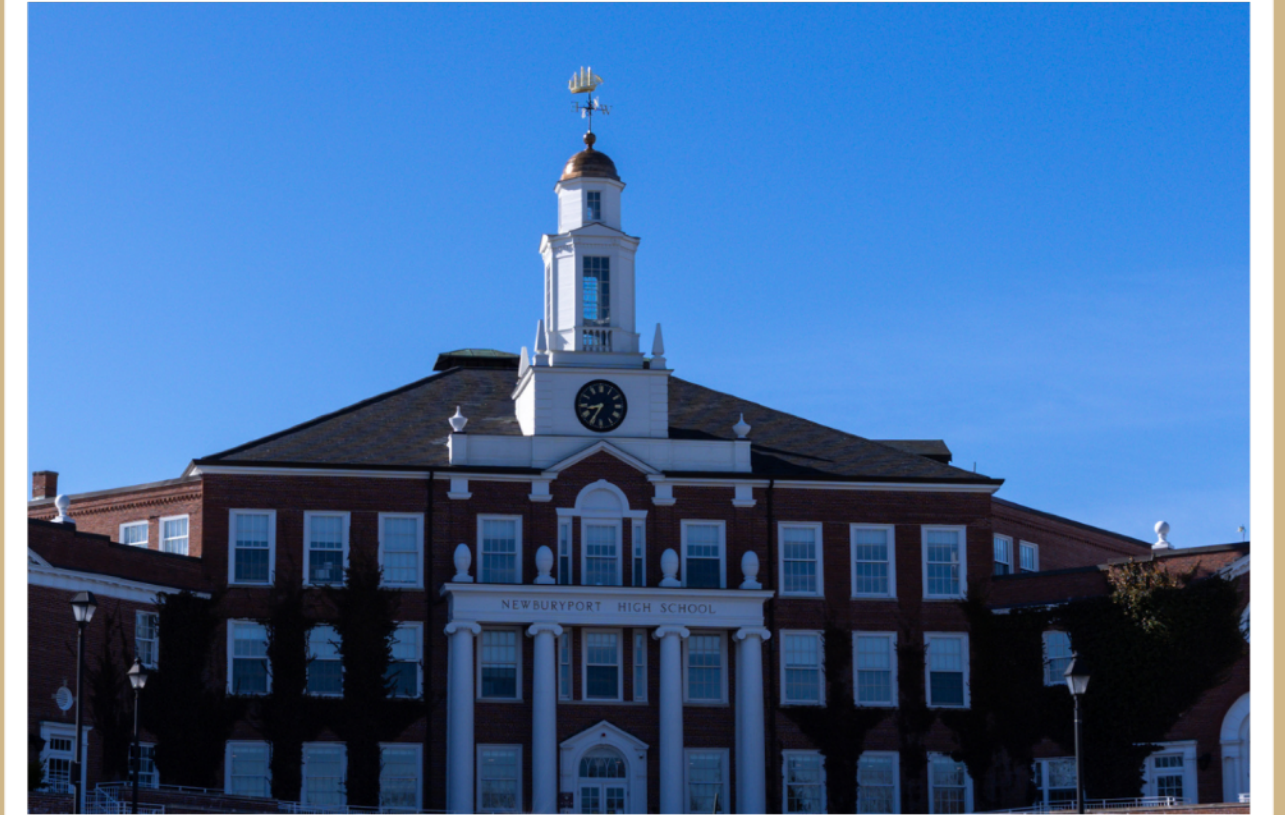
Newburyport High School